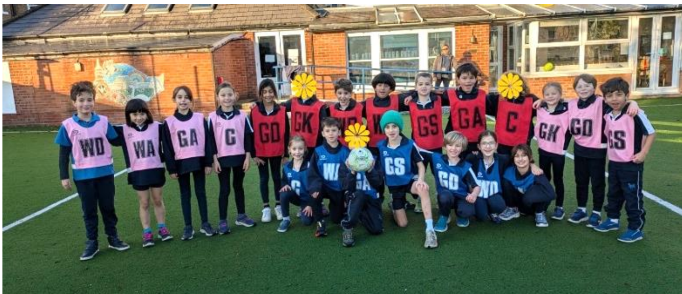
Violet and UV girls' matches v Orchard House