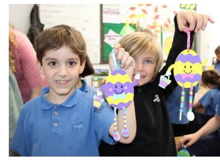
Orange Class' Easter egg hunt